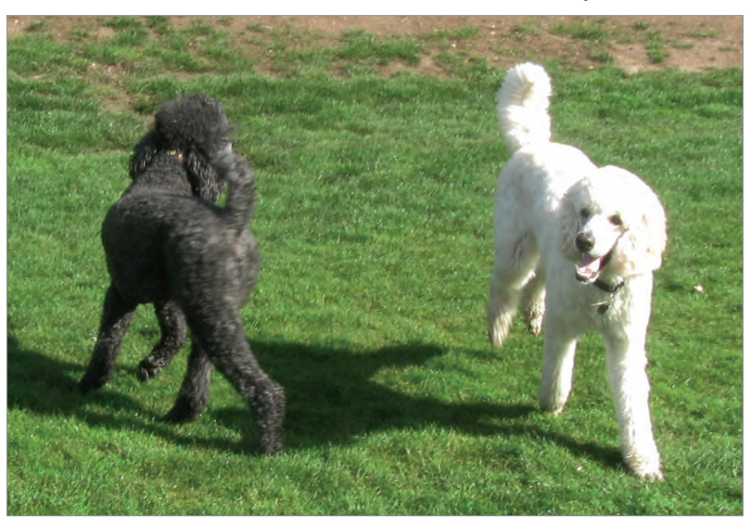
These dogs would like a dog park

Local residents are working to establish a fenced public dog park at the former Rancho Canada. Sound familiar? Well, the vision for this is quite different from the earlier Canine Sports Center proposed for Valley Greens Drive, across from Quail Lodge. The earlier project caused controversy both because of its location in a residential neighborhood and because of increased traffic from special events. It was ultimately turned down by the county's board of supervisors in October 2015.