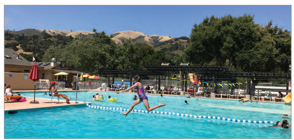
Summer Fun at CV pool

Last chance for a dip! The Carmel Valley Community Youth Center provides supervised aquatics for adults, children and families. Members and non-members alike are welcome.